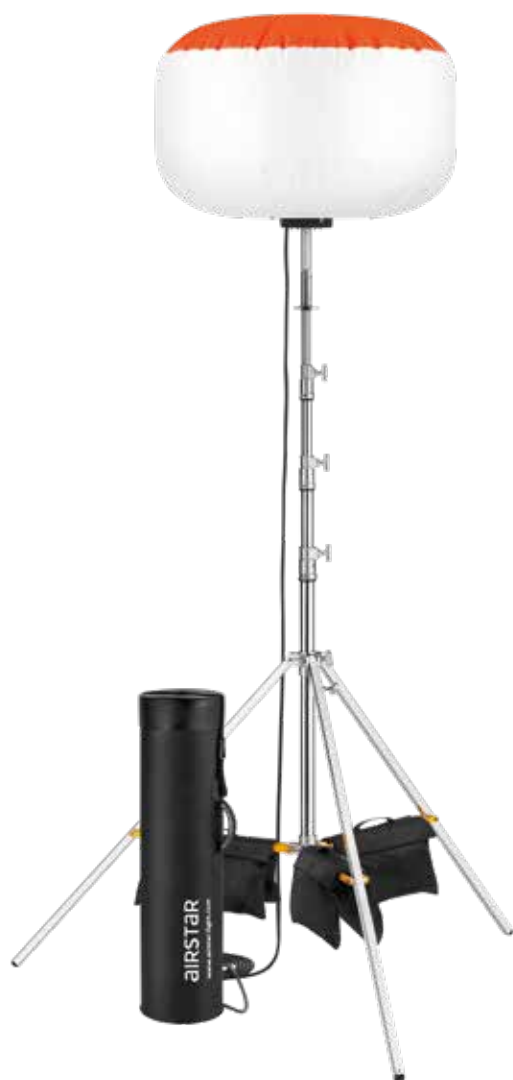
Sirocco by Airstar