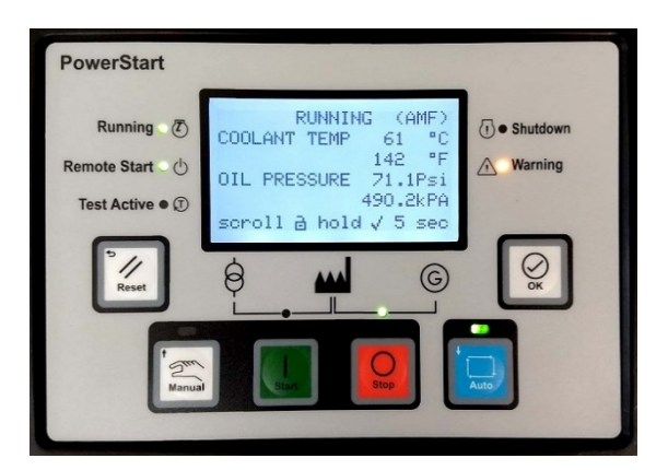
PowerStart 600 control operator/Display

Note: Please, refer to PS0600 product literature for additional Information on Control System.