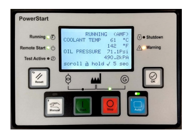
PowerStart 600 control operator/Display

Note: Please, refer to PS0600 product literature for additional Information on Control System.