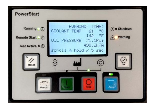
PowerStart 600 control operator/Display

Note: Please, refer to PS0600 product literature for additional Information on Control System.