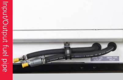
Unit of measure: mm